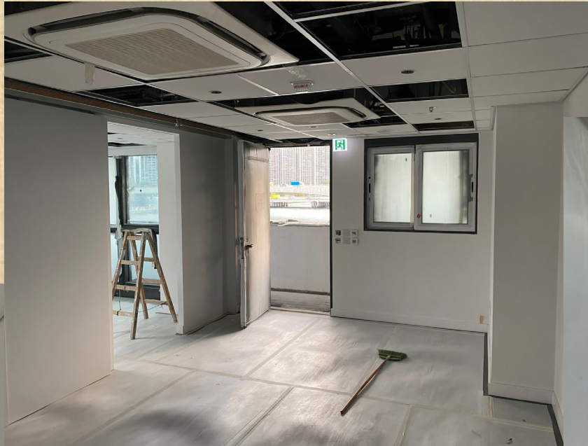
Clubs Storage Room 2