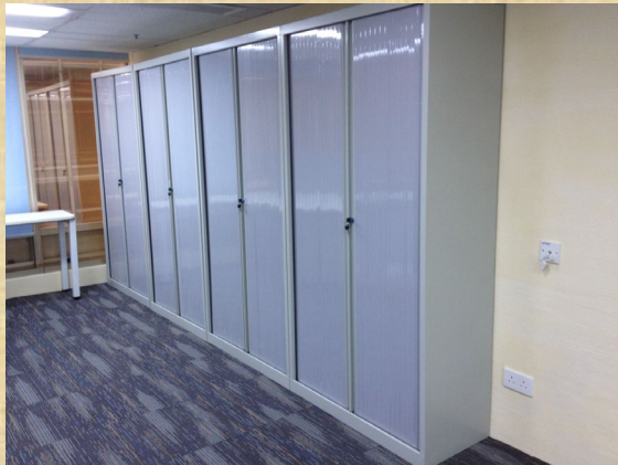
1000x450x1980H – JCSTRC Locker Spec