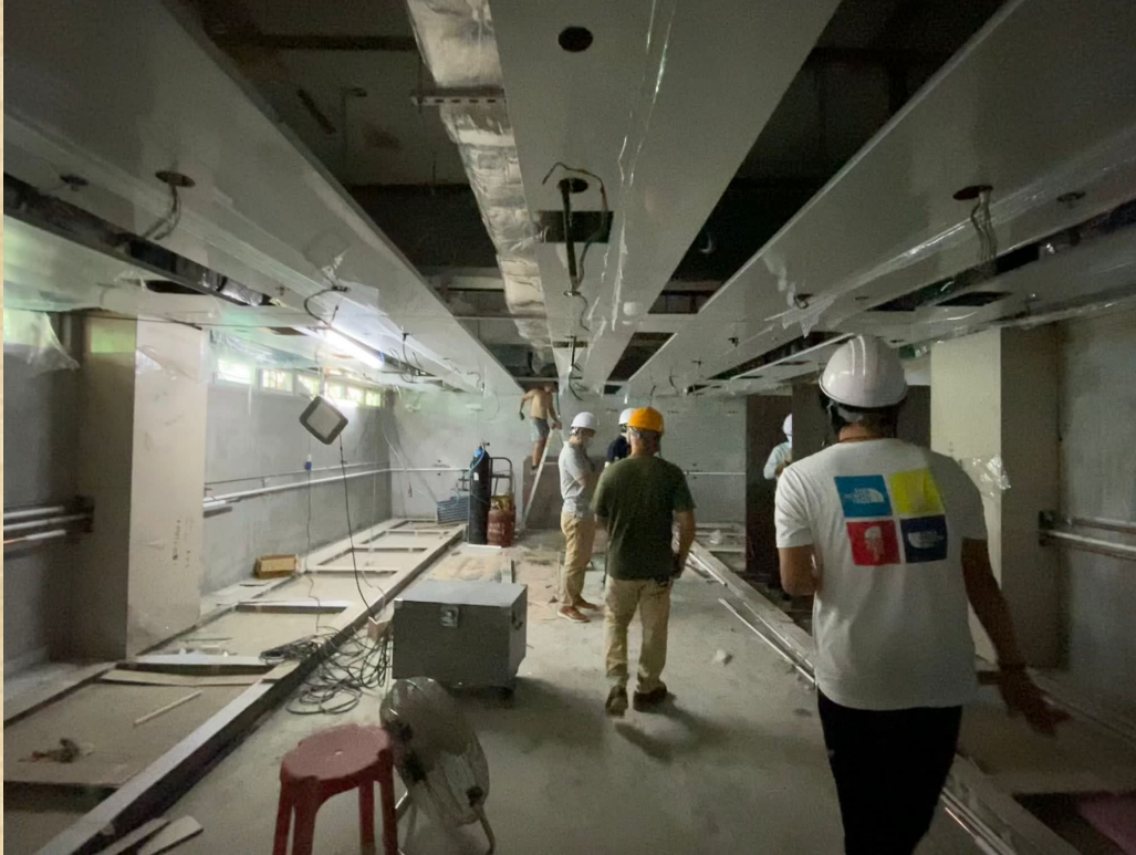
Female Showers Facilities