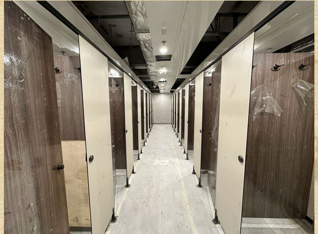
Female Showers Facilities