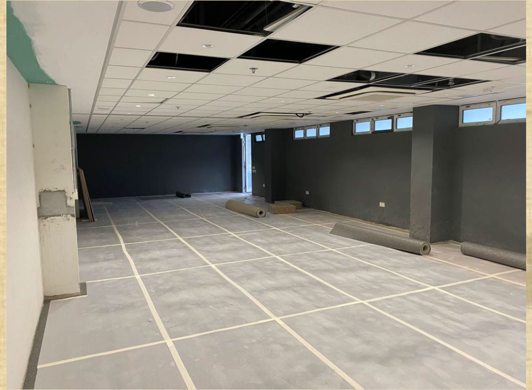
Multi Function Room