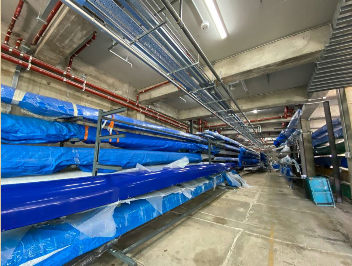
Boat House - Bay 1