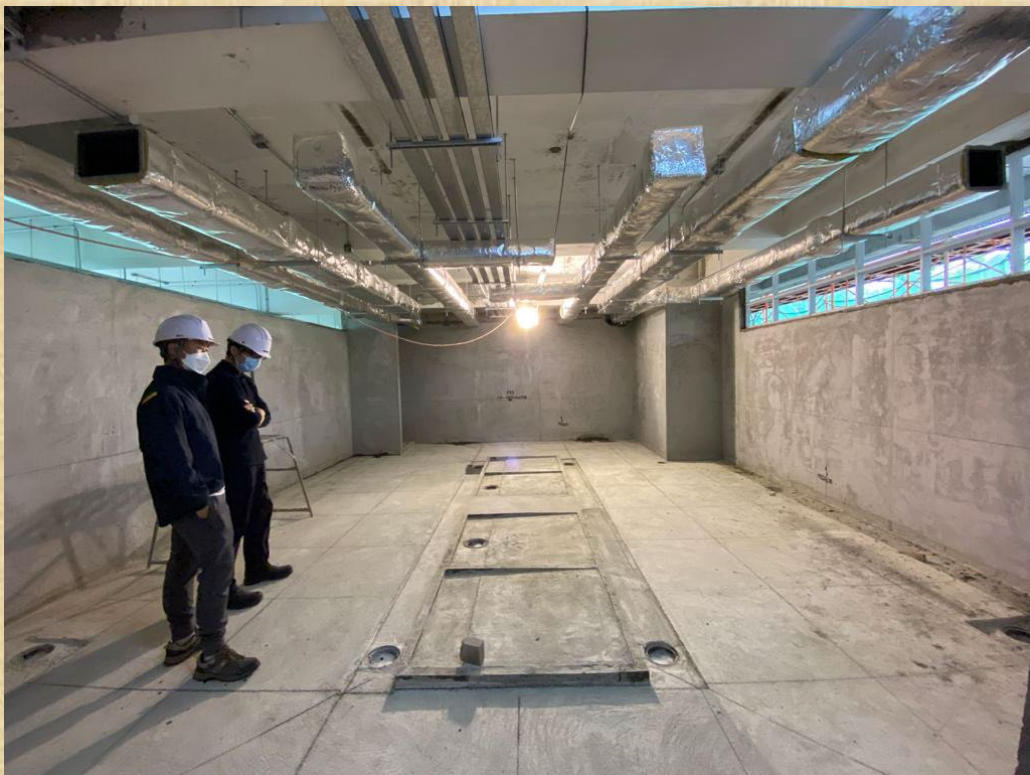
Male Shower Facilities