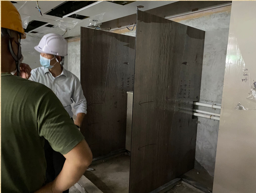
Female Showers Facilities