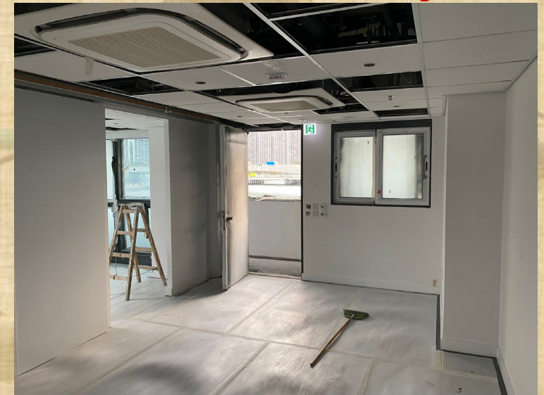
Clubs Storage Room 2