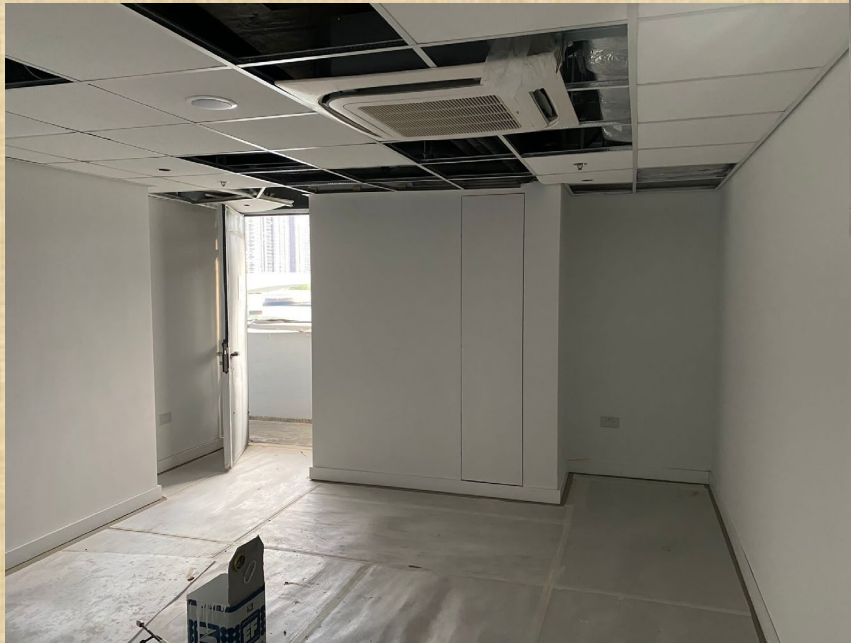
Clubs Storage Room 1