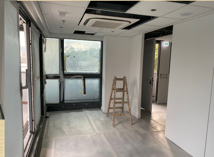
Clubs Resting Area