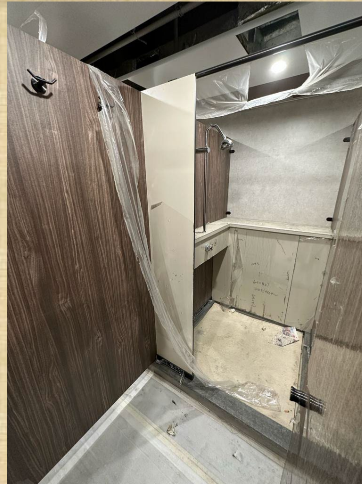
Female Showers Facilities