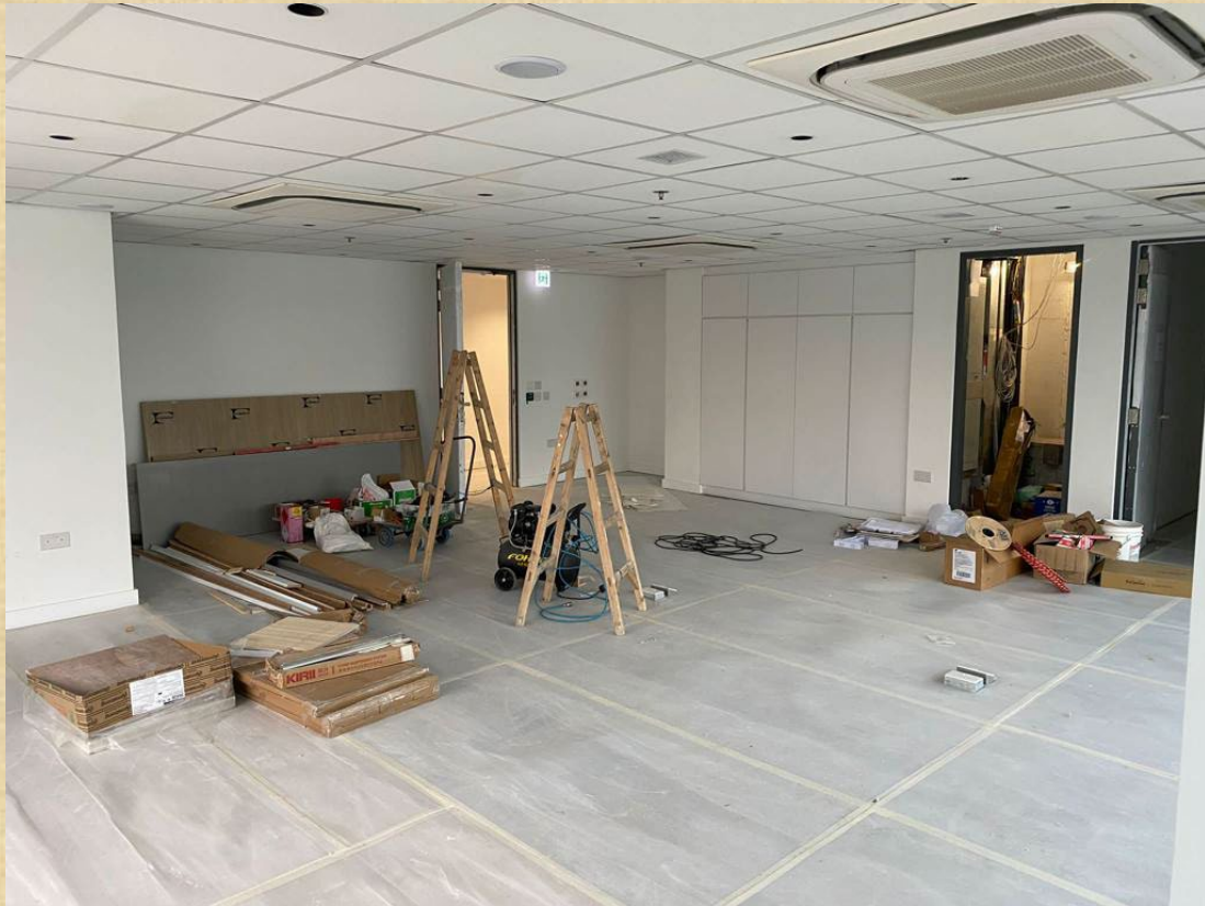
Race Operations Room