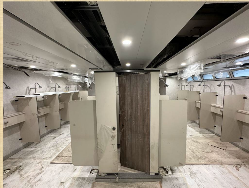
Male Shower Facilities