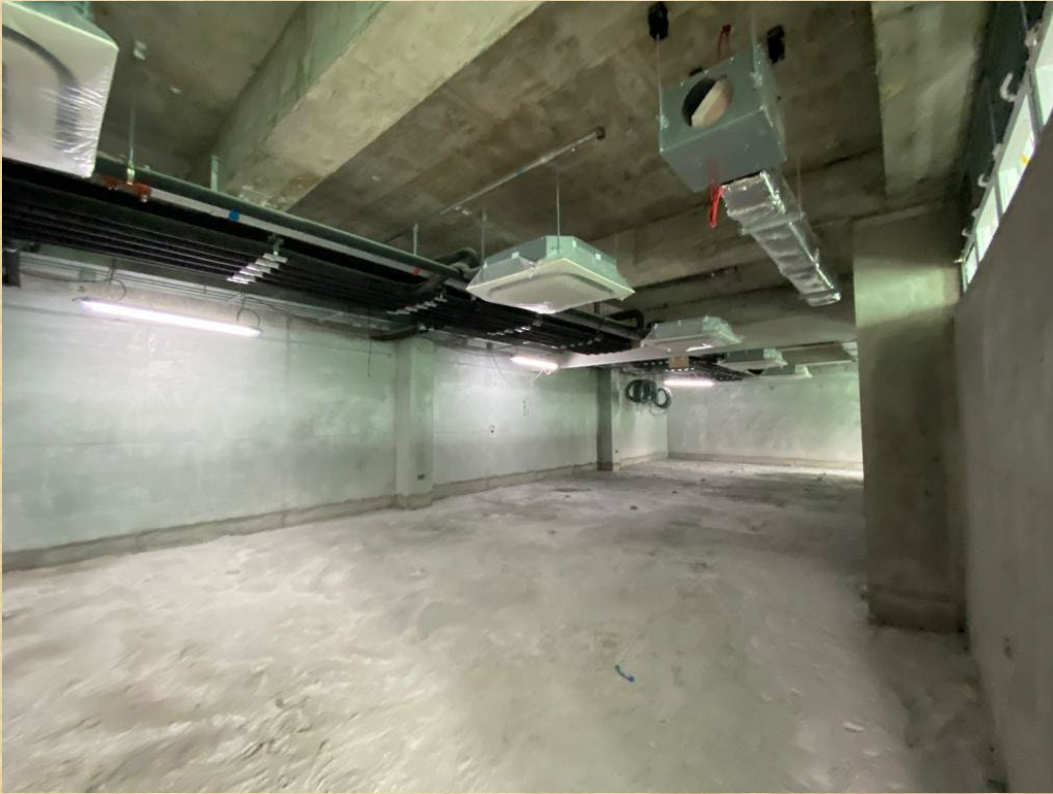
Multi Function Room