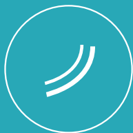
Dual Skin Hull